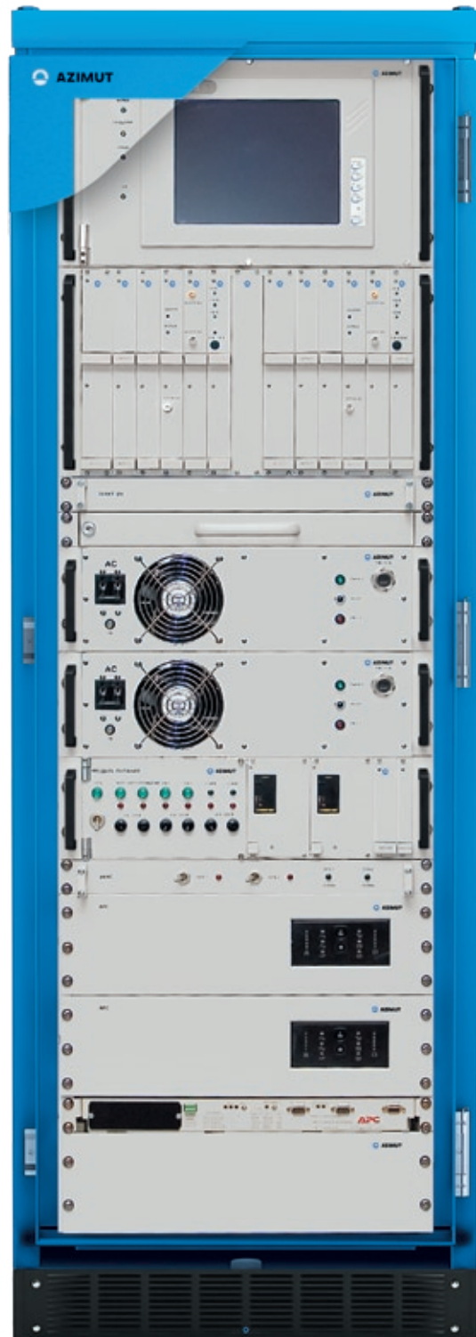
Rack with equipment

The DME 2000 radio beacon utilizes the operational principles and the signal format of DME/N equipment in accordance with Appendix 10 to the "Convention on International Civil Aviation (ICAO)". The radio beacon can be used in conjunction with the VOR (DVOR) and with Instrument Landing System (ILS) or independently.