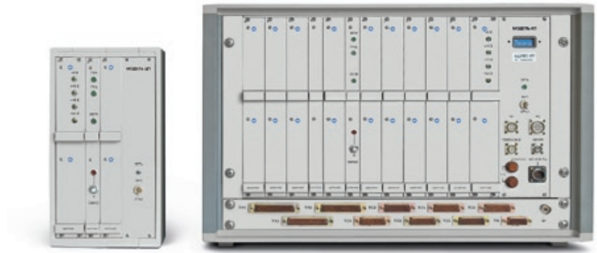
Central Point Module

The industrial objects control system TS 2000 is intended for remote control of industrial objects and monitoring their state. TS 2000 is applied for control power substations of tram and trolleybus networks, distribution and transformer substations of city electric system, street illumination system objects, and equipment of water- and heat-supply systems.